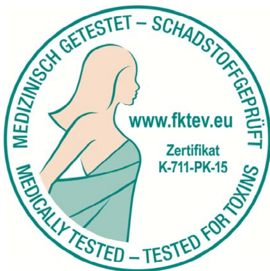
FKT label „MEDICALLY TESTED – TESTED FOR TOXINS“